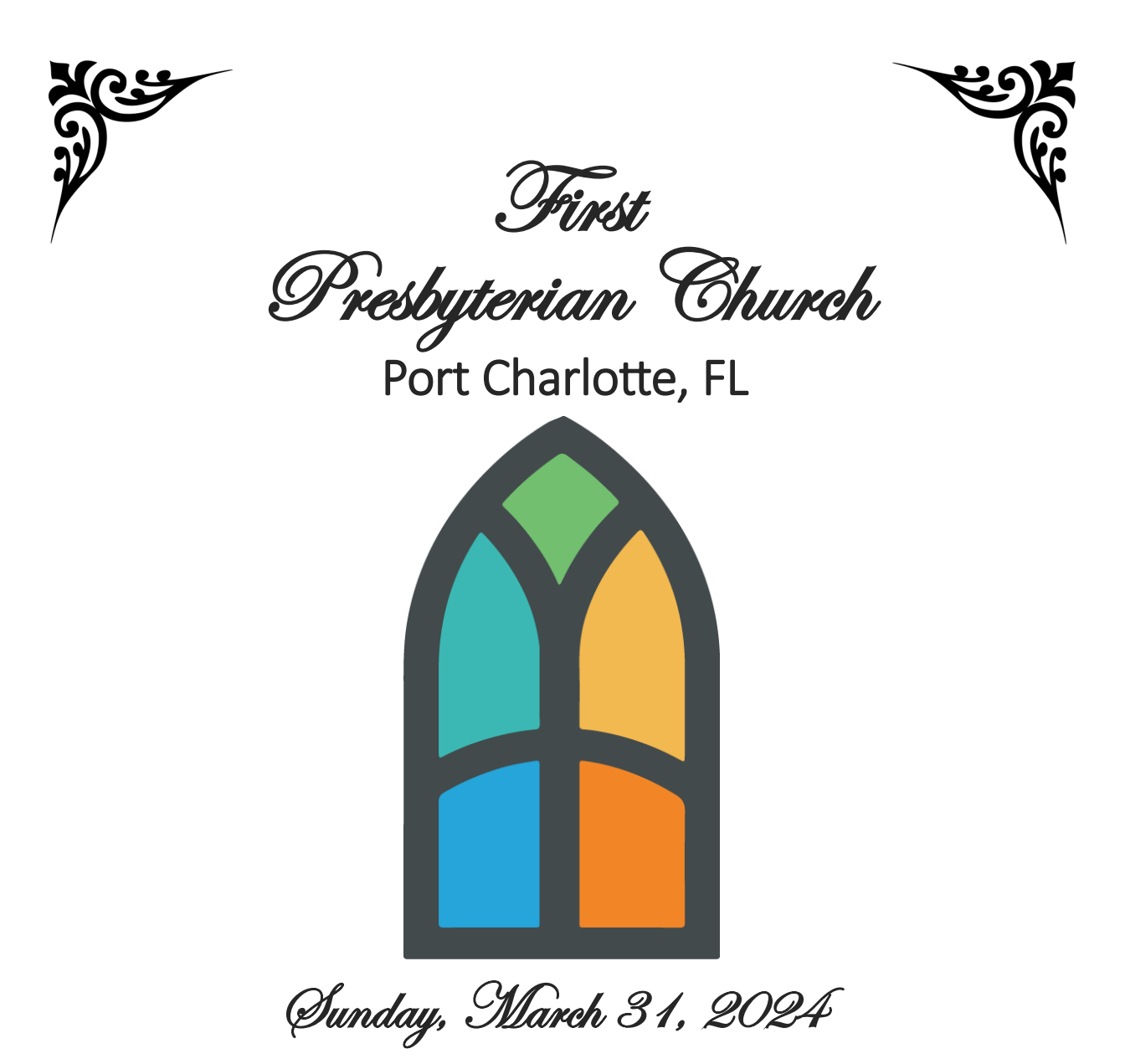
Easter Sunday www.fpcpc.com www.facebook.com/1stPC